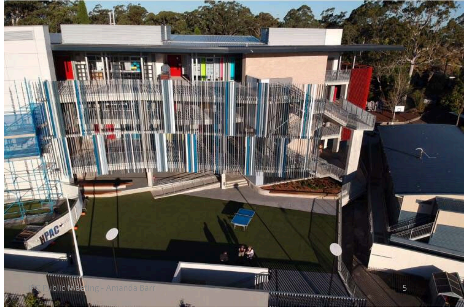
Image 4: SE corner unit of Block B at 22m set back and at sixth floor height