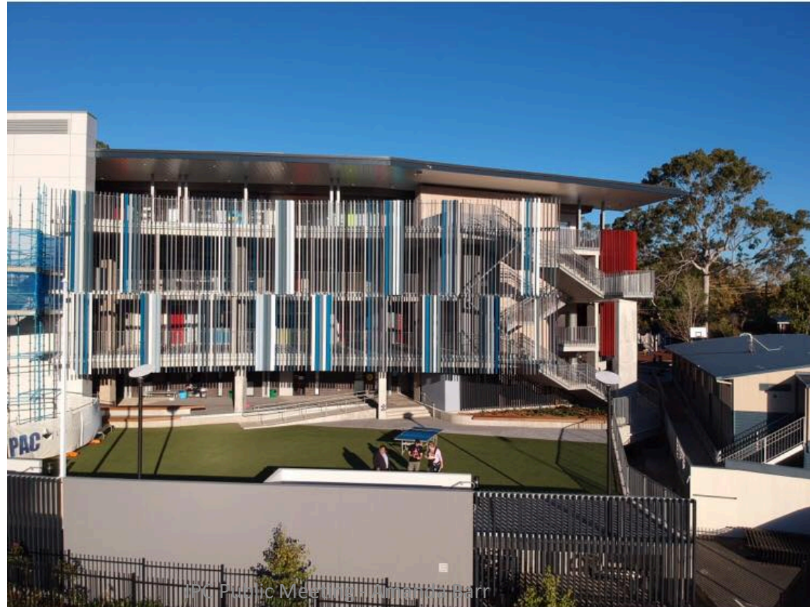
Image 3: SE corner unit of Block B/SW corner of Block C, at 22m set back from the concrete wall of the podium holding the astro turf (as indicated on the architects plans last night) and at fourth floor height