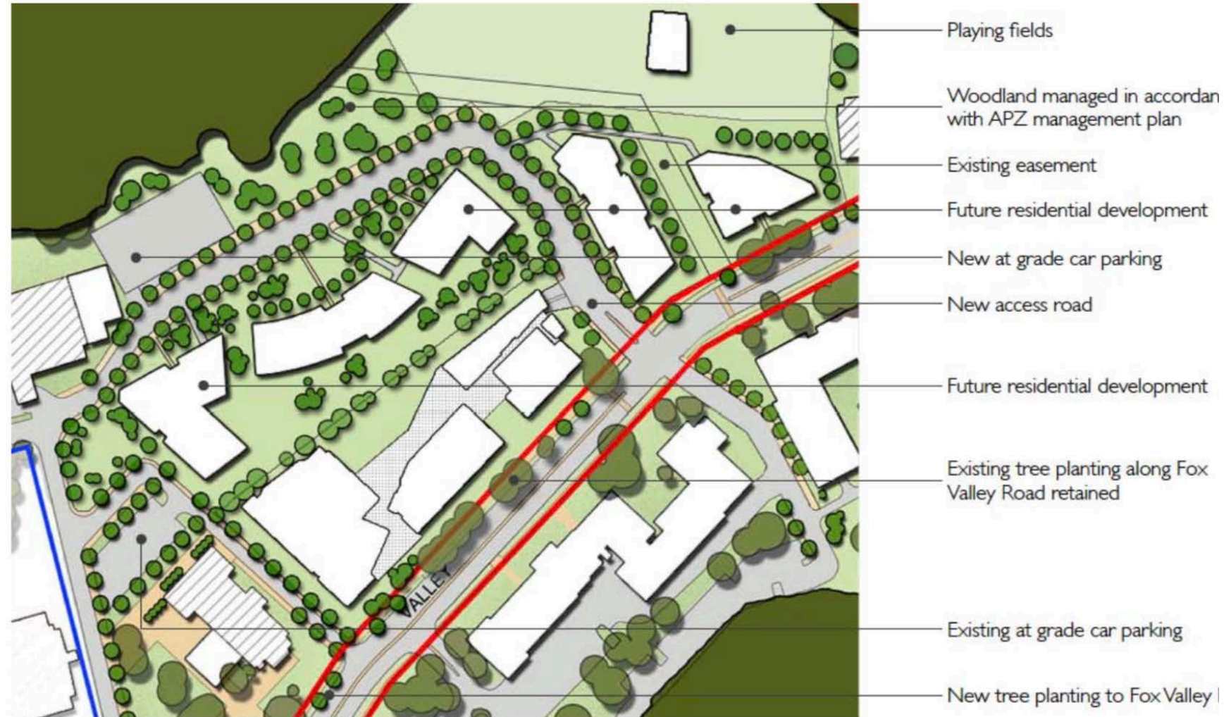
Precinct B: Central Church detail (incorporating MOD 5)

Wahroonga Adventist School: Architectural Design Report – Issue C