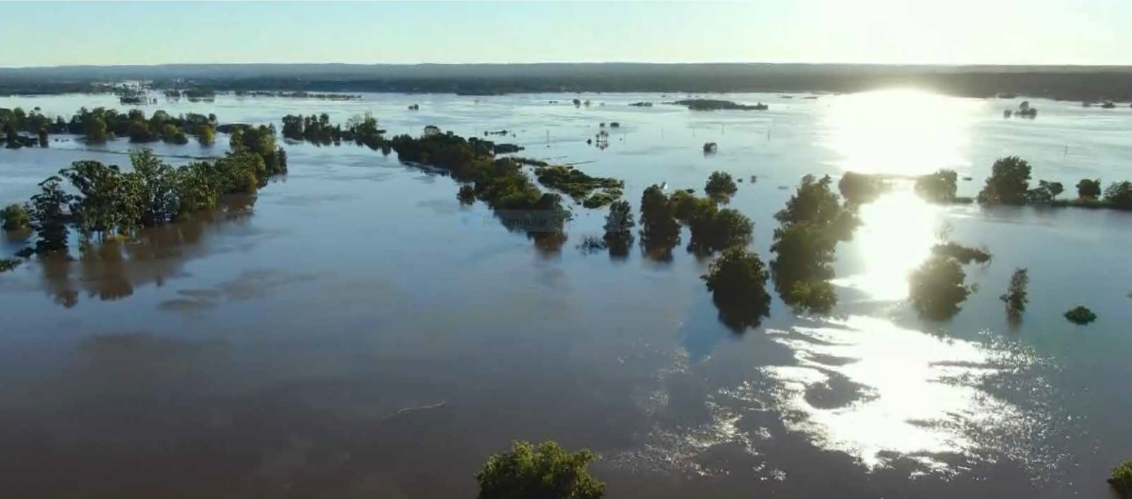
Governor Phillip Park in flood, March 2021 — Infrastructure NSW | Top Notch Video