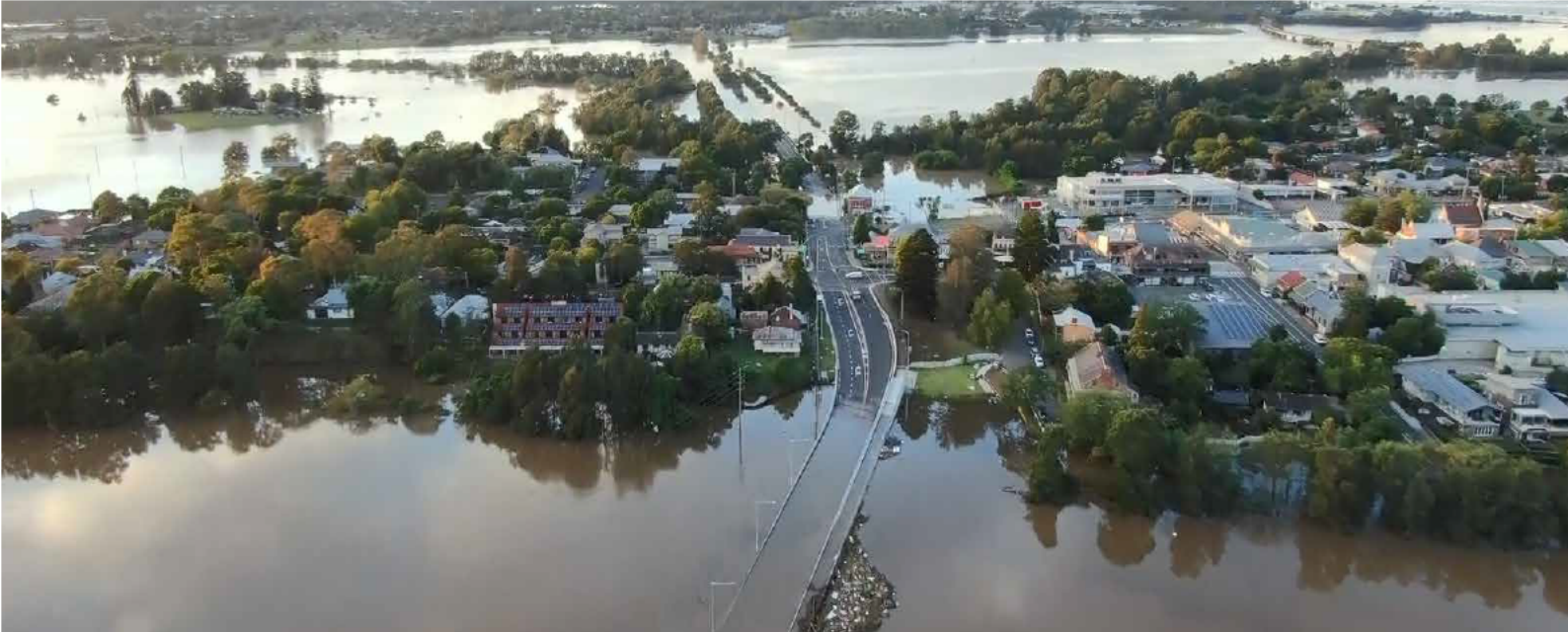
Windsor, looking east March 2021.