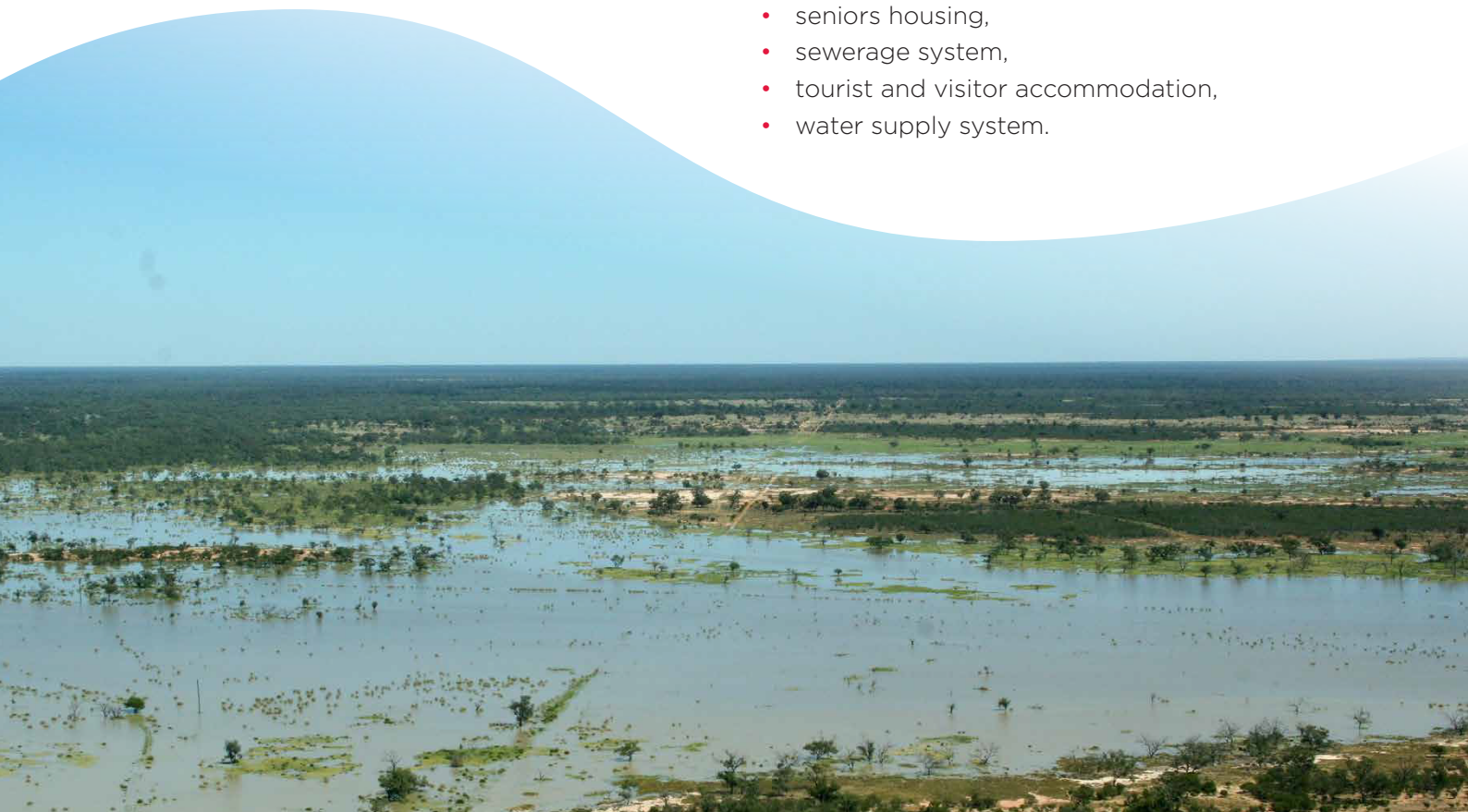
Warrego flooding between Fords Bridge and Engonnia