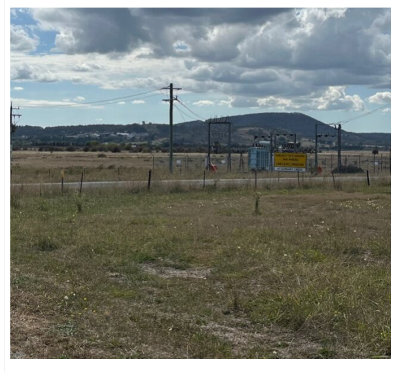
Figure 1 – Location 1, view of existing substation north of Figure 2 – Location 2, view of "Allfarthing" homestead Brisbane Grove Road