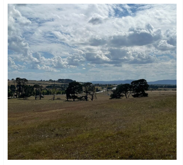
Figure 6 – Locality tour, view of the bridge crossing of the Mulwaree River from the south of the bridge

Figure 5 – Location 4, view of Braidwood Road to the northwest of the Site