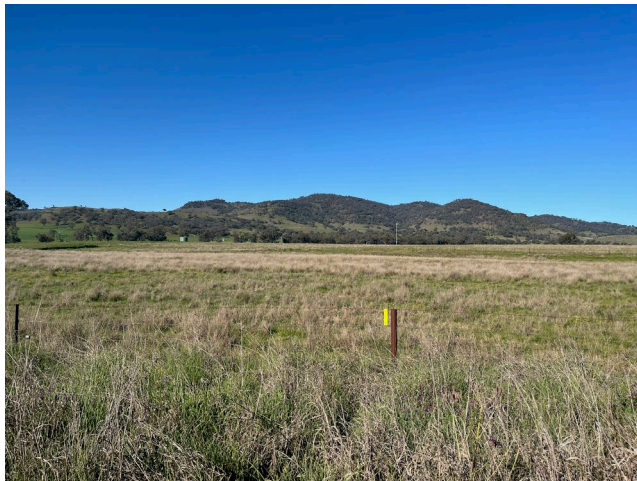
Figure 4 – Locality of proposed internal access track crossing