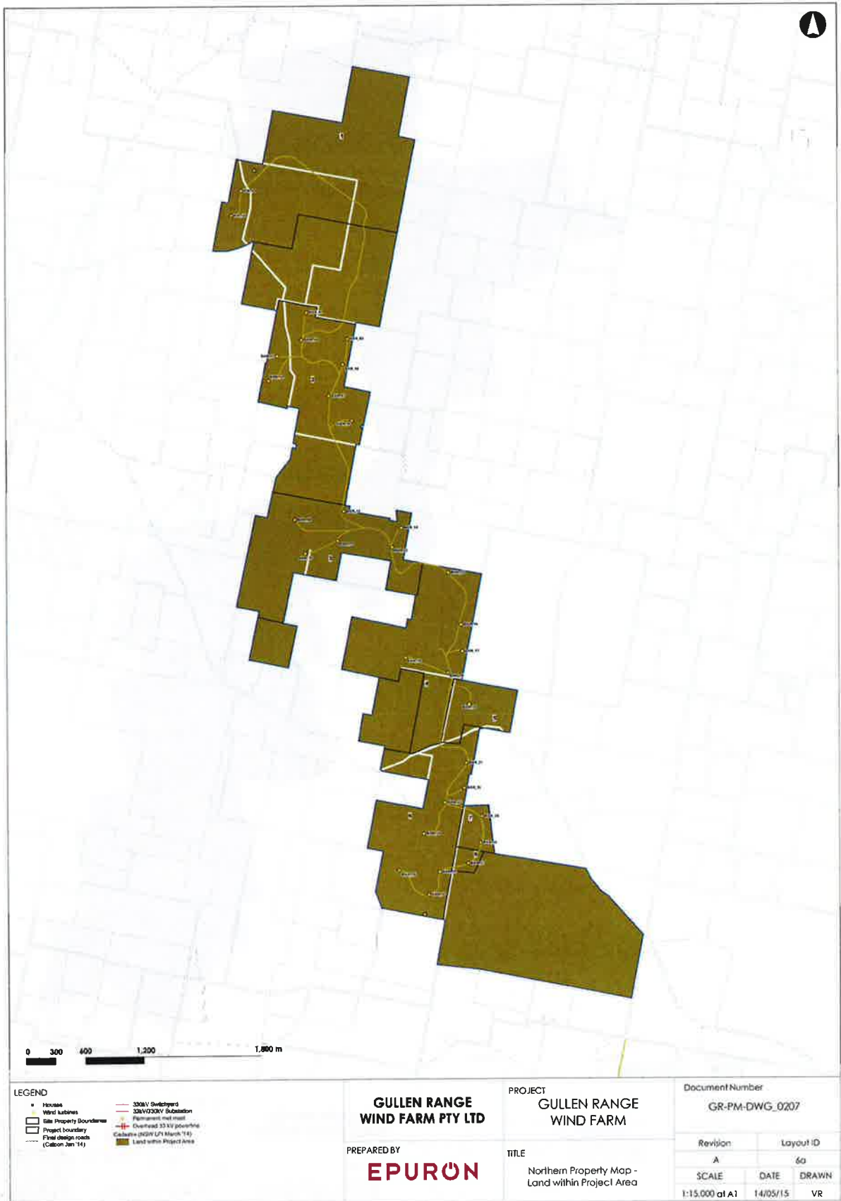
Figure A1-1 Project Layout – Northern Turbines