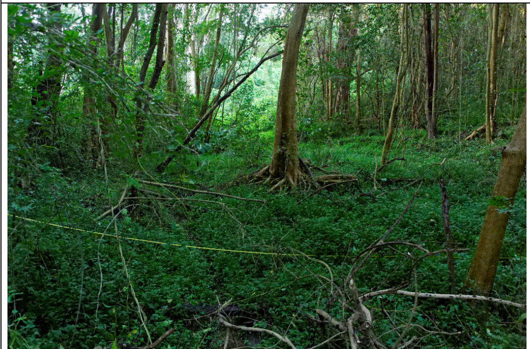
Quadrat 6 (50–60 m): Ligustrum lucidum and groundlayer of Tradescantia fluminensis