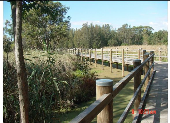
Sydney Coastal Estuary Swamp Forest Complex at the Warriewood wetlands