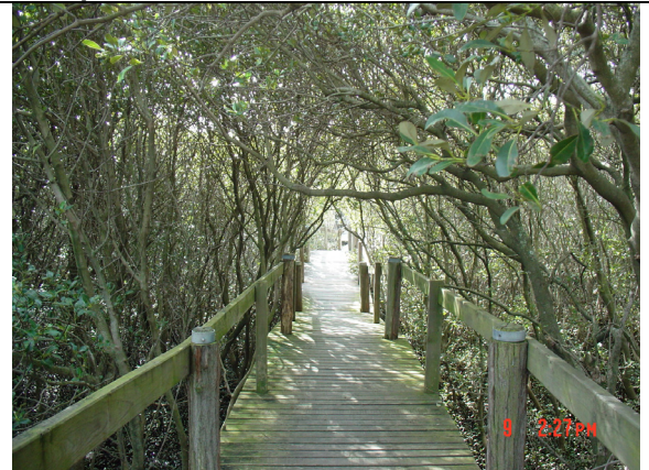
Mangrove swamp at Towra Point Nature Reserve