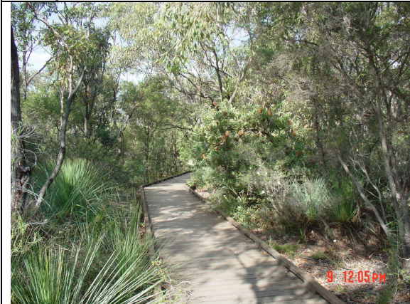
Eastern Suburbs Banksia Scrub at Jennifer Street, Botany Bay National Park