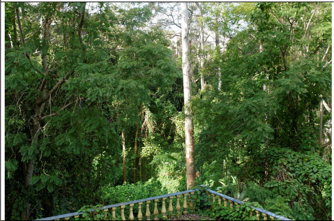
View downslope from house and pool on 8 Beechworth Road, with Eucalyptus saligna , Jacaranda mimosifolia , Schefflera actinophylla