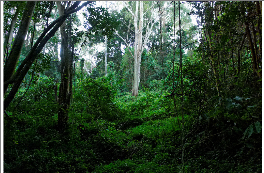
Centre of gully looking upslope from near west end of Transect 2