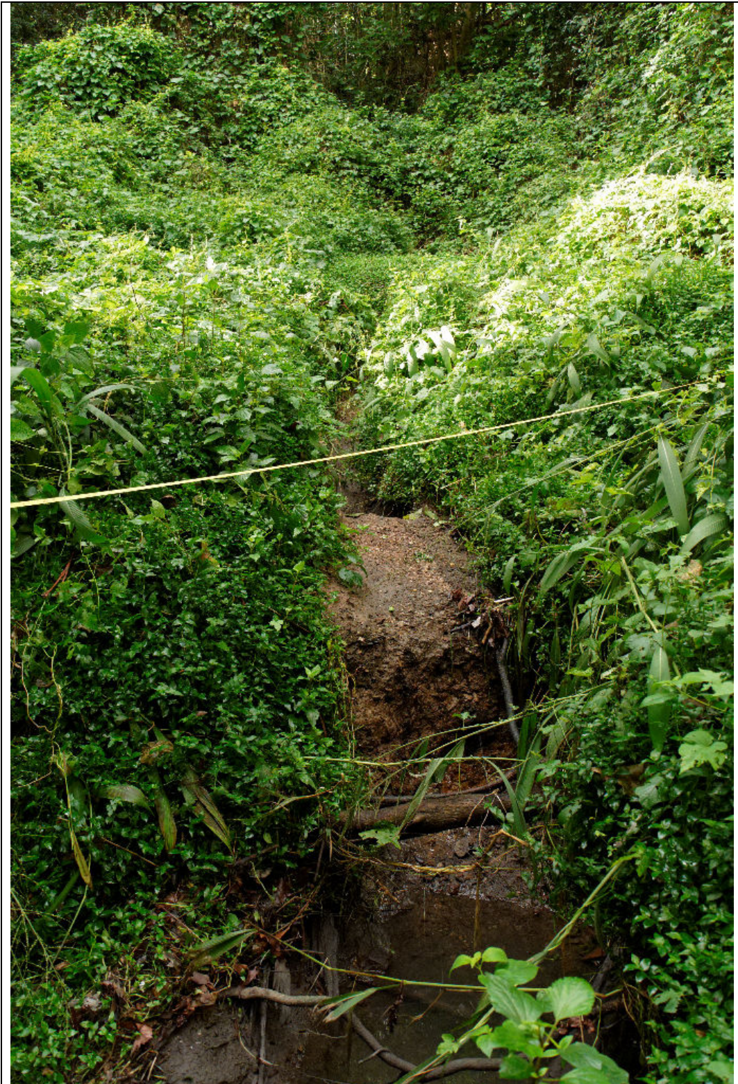
Quadrat 6 (50–60 m): Centre of gully with rock rubble revealed by erosion, with Tradescantia fluminensis , Setaria palmifolia .