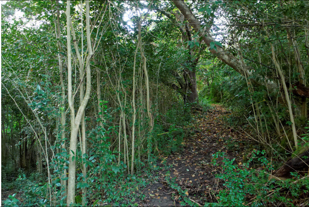
Quadrat 1 (0–10 m): Ligustrum lucidum