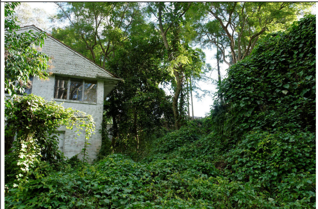
House on 8 Beechworth Road, upslope and west of Quadrat 10.