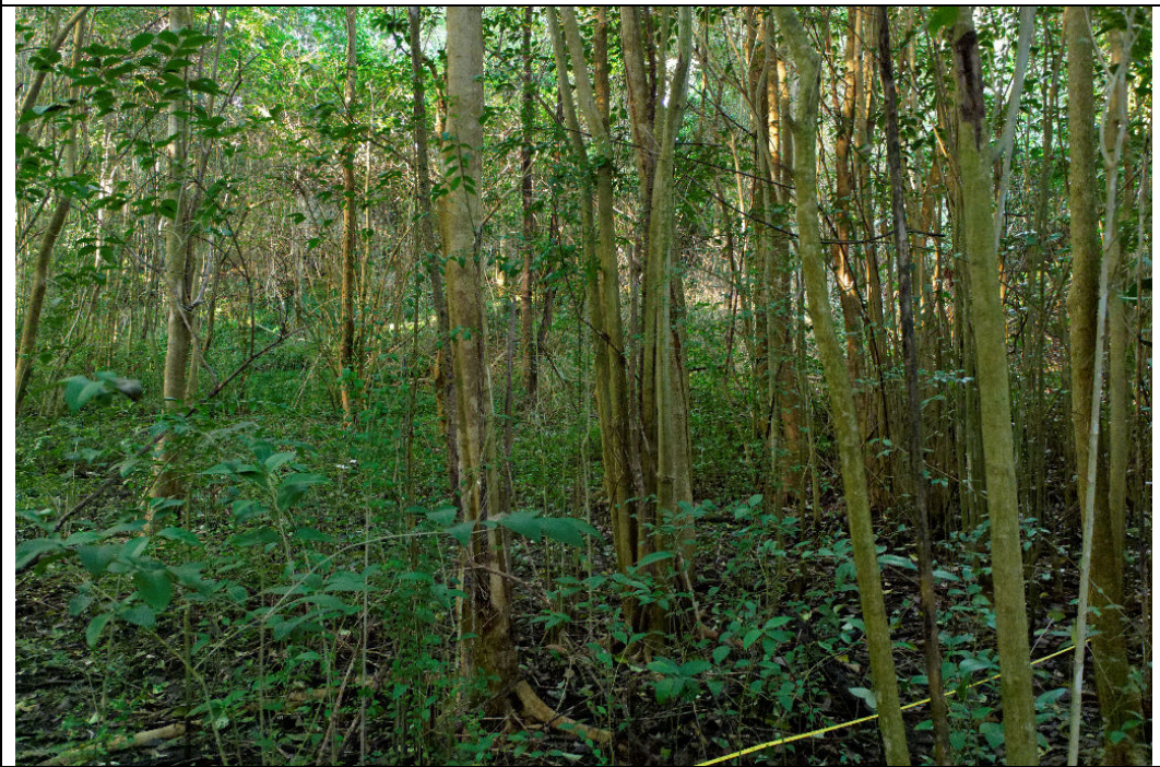
Quadrat 4 (30–40 m): Ligustrum lucidum