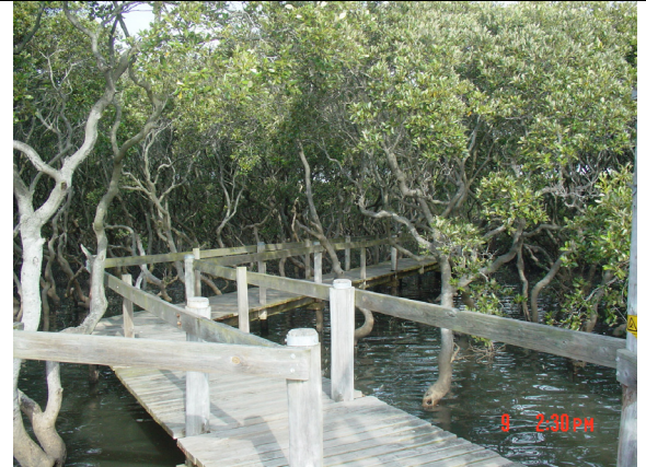
Mangrove swamp at Towra Point Nature Reserve