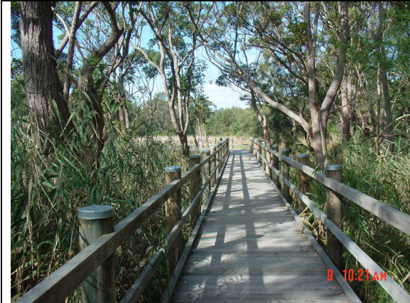
Sydney Coastal Estuary Swamp Forest Complex at the Warriewood wetlands