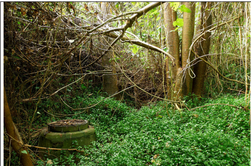
Quadrat 6 (50–60 m): Sewer manhole. Dense Tradescantia fluminensis and Erythrina x sykesii .