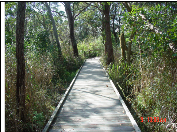
Sydney Coastal Estuary Swamp Forest Complex at the Warriewood wetlands