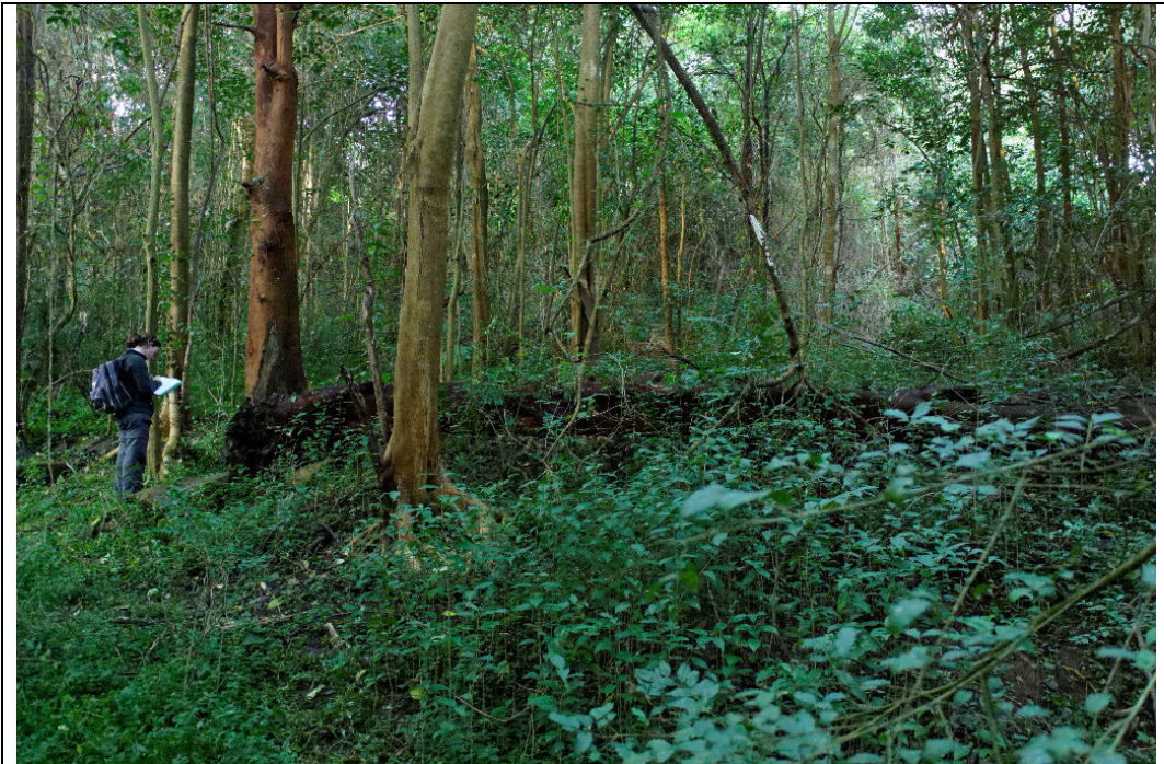
Quadrat 5 (40–50 m): Acmena smithii (brown trunk at left), Ligustrum lucidum and groundlayer of Tradescantia fluminensis