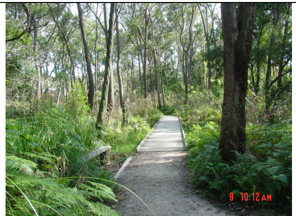
Sydney Coastal Estuary Swamp Forest Complex at the Warriewood wetlands