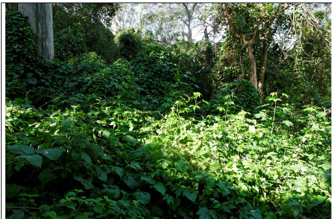
Quadrat 8 (70–80 m): Eucalyptus saligna with smothering by Ipomoea indica