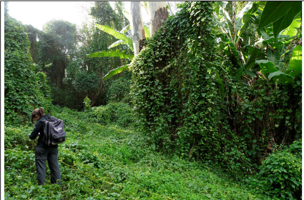
Quadrat 10 (90–100 m): Eucalyptus saligna and Musa acuminata , with smothering by Ipomoea indica