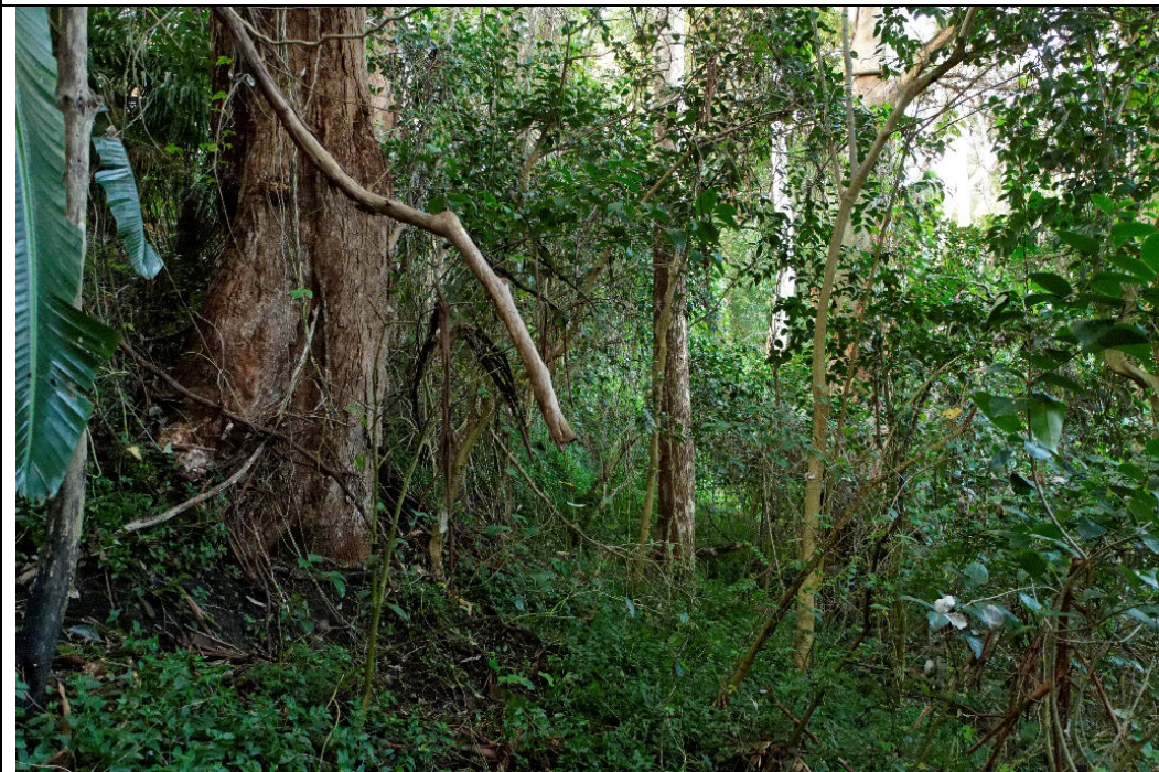
Spot location A: Eucalyptus saligna , Ligustrum lucidum , Tradescantia fluminensis . Large leaf at left is Strelitzia nicolai , intruding from adjacent property.