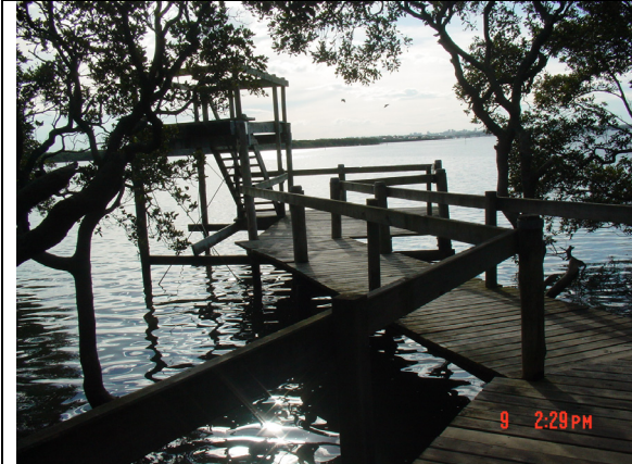
Mangrove swamp at Towra Point Nature Reserve