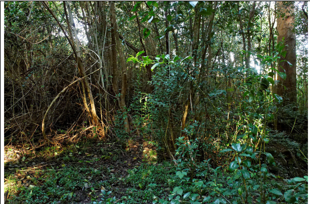
Quadrat 3 (20–30 m): Ligustrum lucidum and smaller Ligustrum sinense