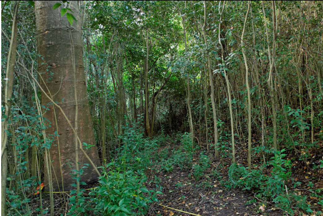
Quadrat 2 (10–20 m): Ligustrum lucidum with trunk of Agathis robusta