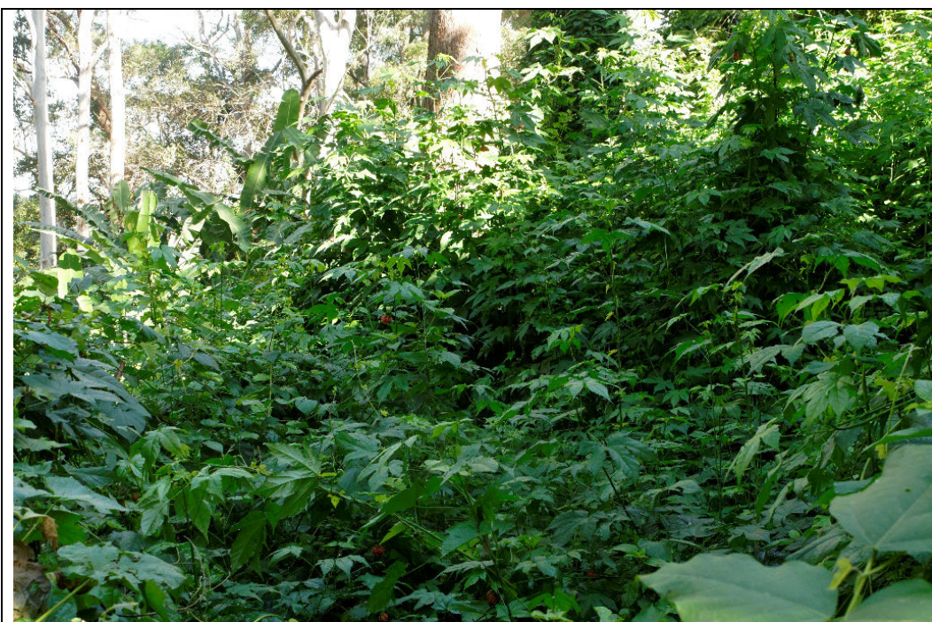
Quadrat 7 (60–70 m): Tangle of branches of Abutilon striatum 6–8 m across