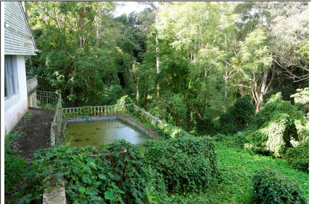
Looking north-east across swimming pool on 8 Beechworth Road, showing groundlayer and mid-storey smothered by Ipomoea indica .