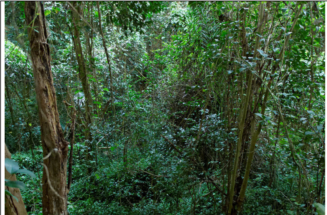
Spot location A: looking downslope toward Transect 2. Mostly Ligustrum lucidum , Tradescantia fluminensis , with young Syagrus romanzoffiana at centre-right