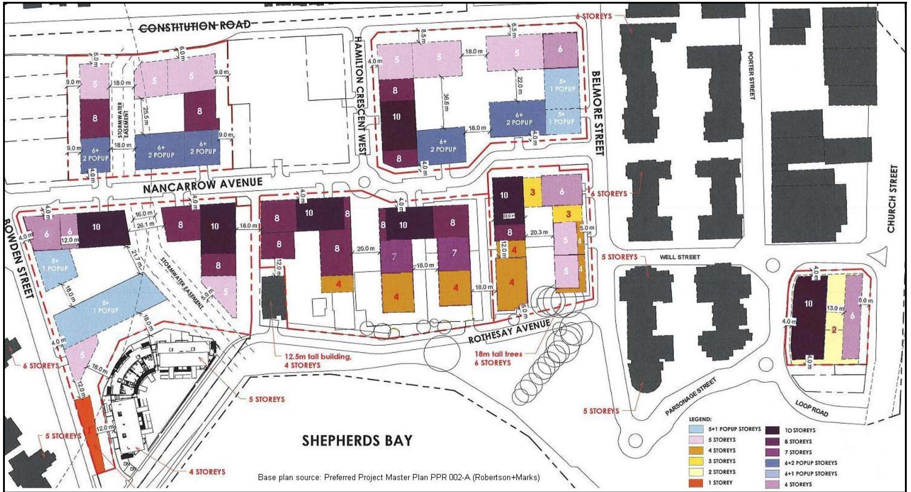
PLAN 1 MAXIMUM NUMBER OF STOREYS ABOVE GROUND LEVEL (FINISHED) AS APPROVED BY THE PLANNING ASSESSMENT COMMISSION (March 2013)