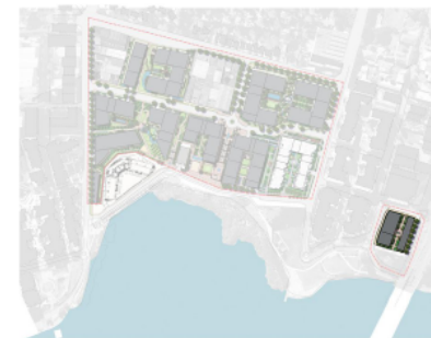
Map 5: Gateway Building Central Plaza