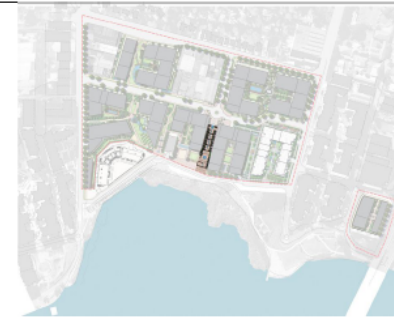
Map 3: New Central Spine