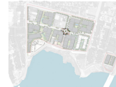
Map 2: New Upper Level Public Square