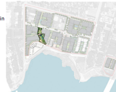
Map 7: New Lower Riparian Foreshore Link