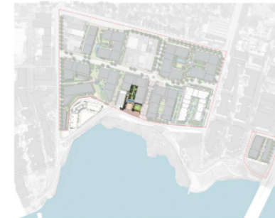
Map 6: New Central Foreshore Plaza