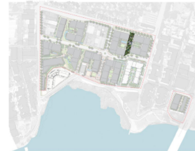
Map 4: New upper eastern pedestrian link