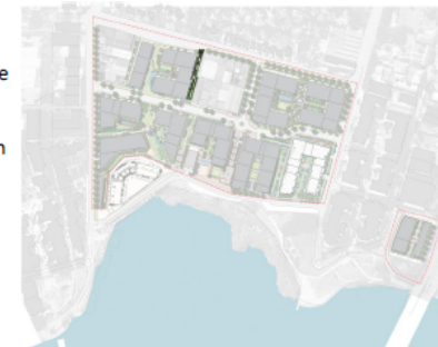
Map 9: New Pedestrian Spine 2 North