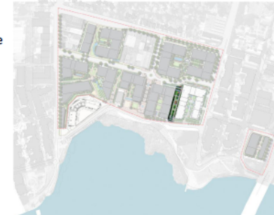
Map 1: New Foreshore Link