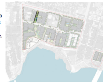
Map 10: Upper Riparian Foreshore Link