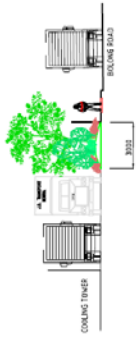
ELEVATION Not to Scale