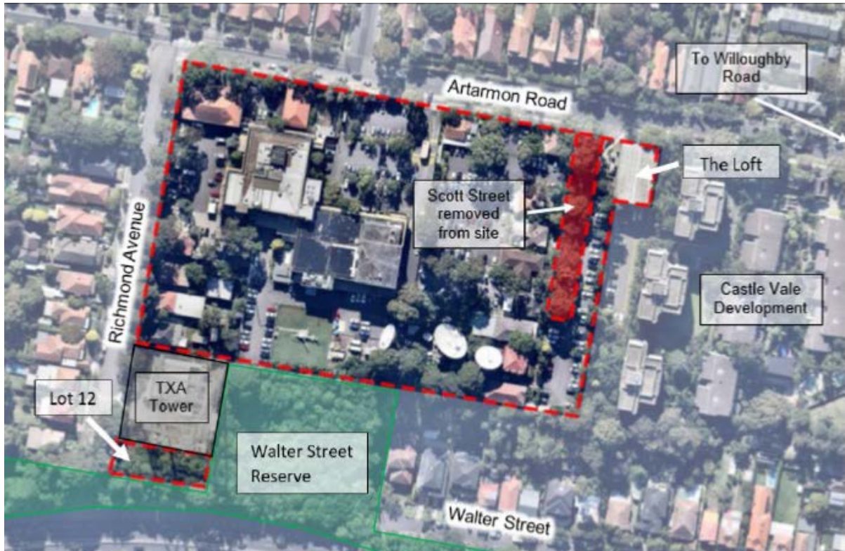
Figure 2 – Aerial view of Site