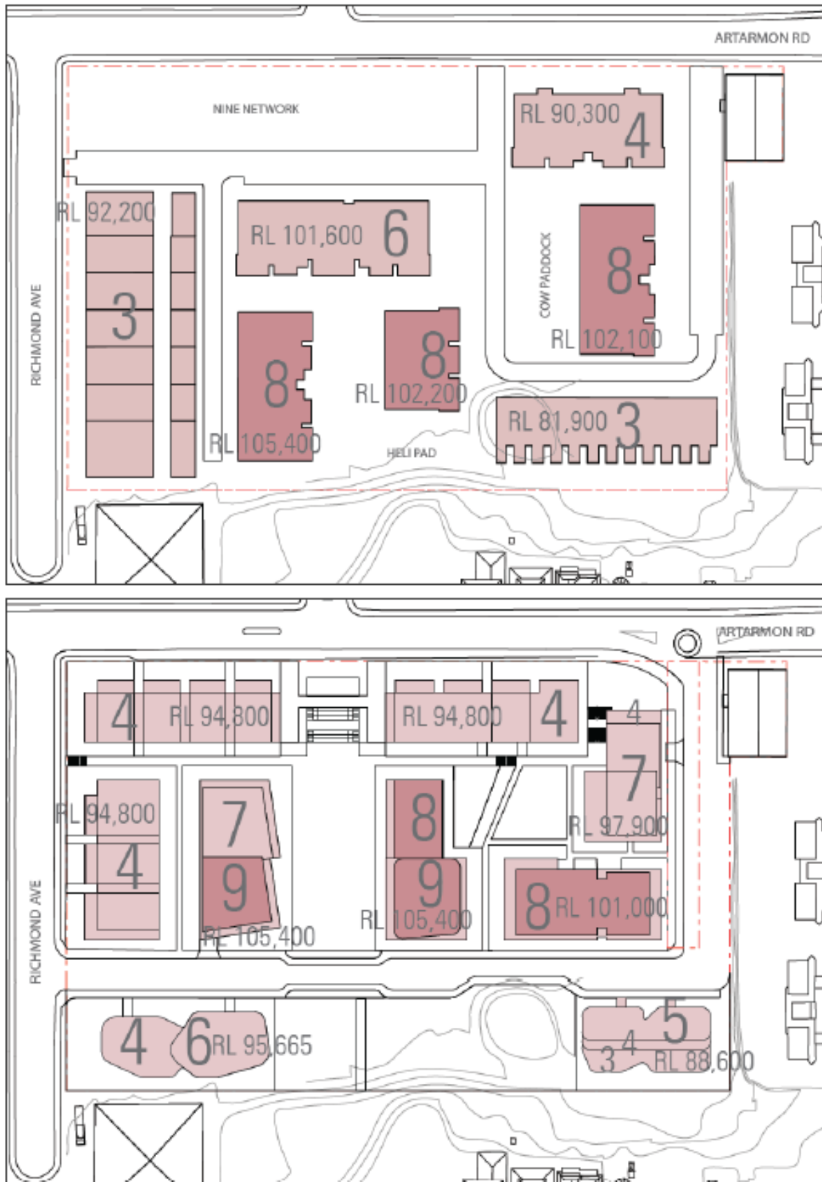
Figure 3 – Layout Comparison - Approved Layout (top) – Proposed Layout (bottom)