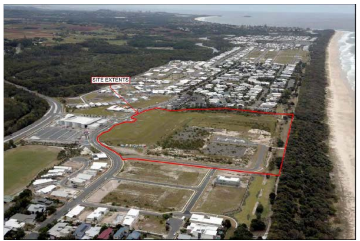
Figure 2 - MOD10 Site Location