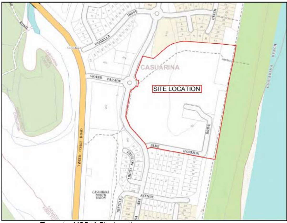
Figure 1 – MOD10 Site Location