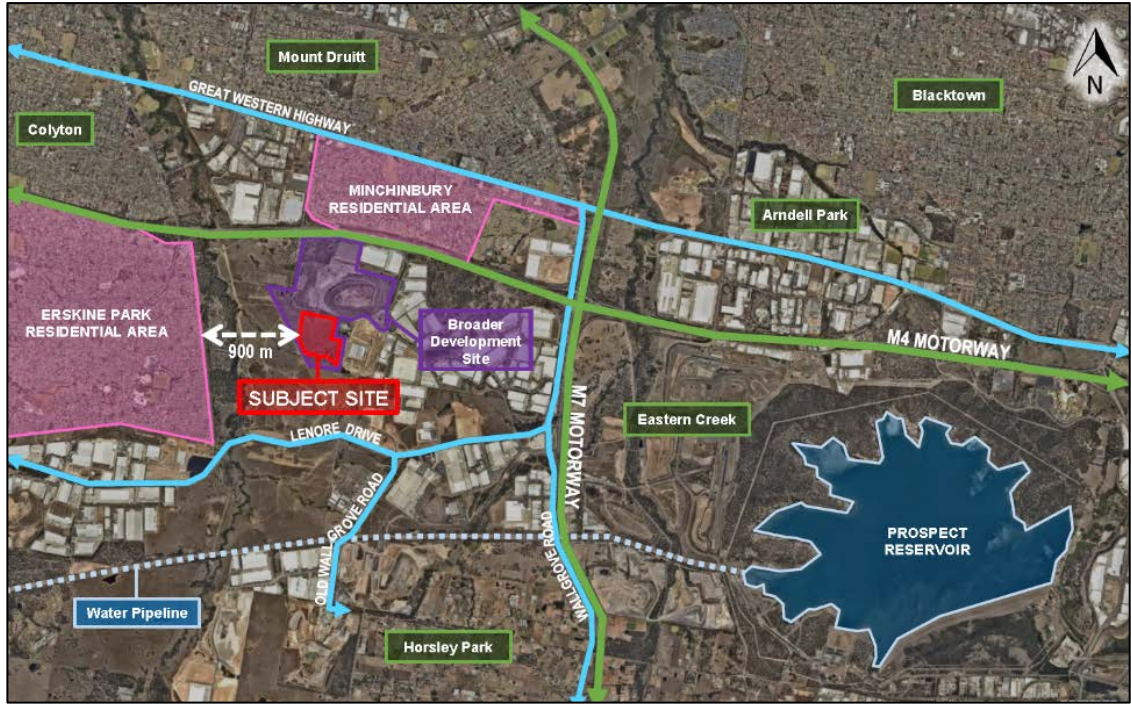
Figure 1 – Site context

7. The applicant's Environmental Impact Statement ( EIS ) states that the site of the EfW Facility covers an area of approximately 20 hectares ( ha ), and is part of a larger industrial precinct located at Honeycomb Drive, Eastern Creek. The site of the EfW Facility is an undeveloped 'greenfield' site, primarily containing couch grass previously used as grazing pasture, and areas of Cumberland Plain Woodland and River Flat Eucalypt Forest in the south-east corner of the site. The site context is provided in Figure 1 .