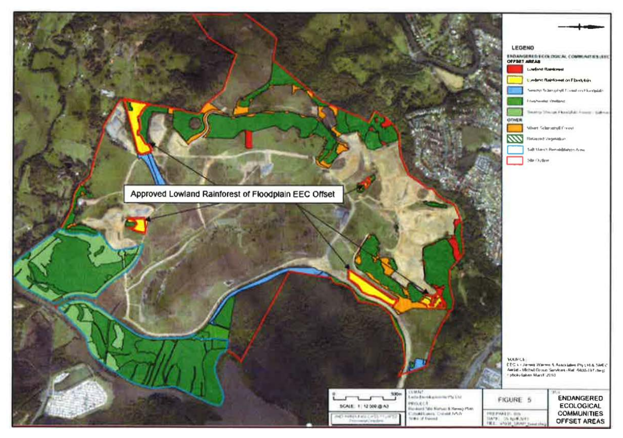
APPENDIX 5 – PROPOSED AREAS OF LOWLAND RAINFOREST ON FLOODPLAIN EEC

APPENDIX 4 – AREA OF LOWLAND RAINFOREST ON FLOODPLAIN EEC CURRENTLY IDENTIFIED ON-SITE