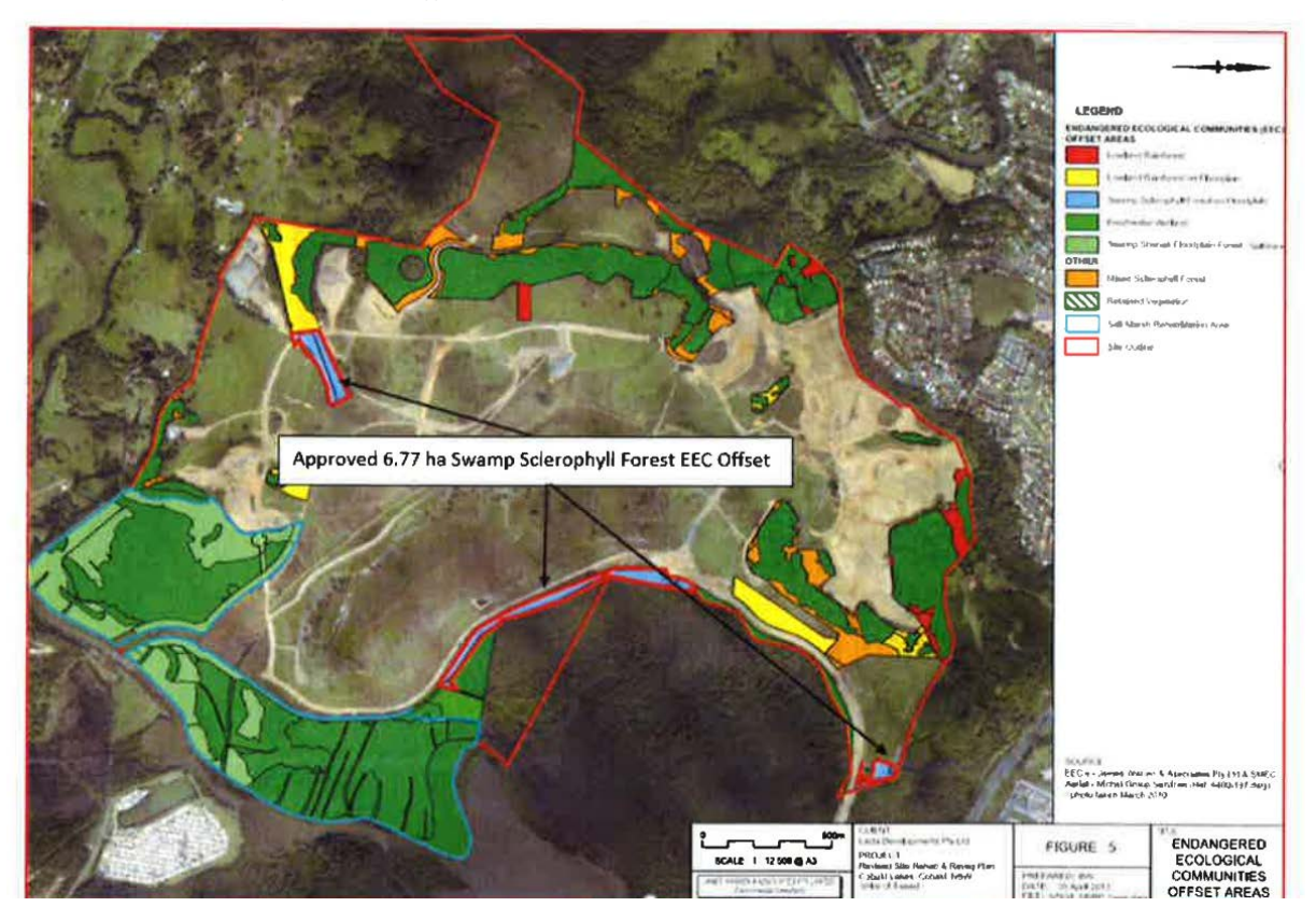
APPENDIX 3 – PROPOSED SWAMP SCLEROPHYLL FOREST EEC OFFSET

APPENDIX 2 – APPROVED SWAMP SCLEROPHYLL FOREST EEC OFFSET