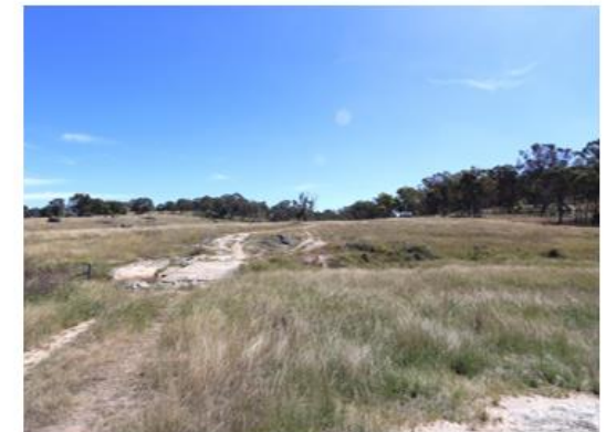
North View – Pine Creek crossing