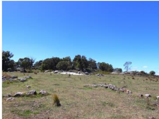
East View – View to proposed batching plant