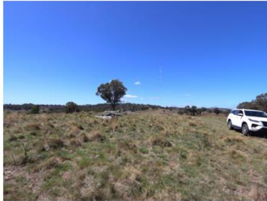
East View – with Woodland in view

Proposed turbine T6 - View of impacted biodiversity land to be offset