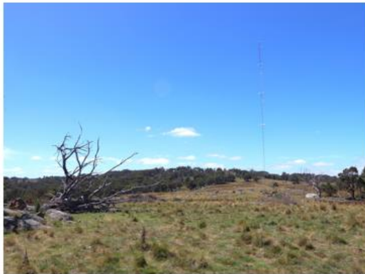
View to the East – Location of switching station and substation