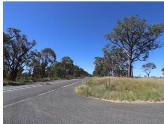
Northeast New England Highway