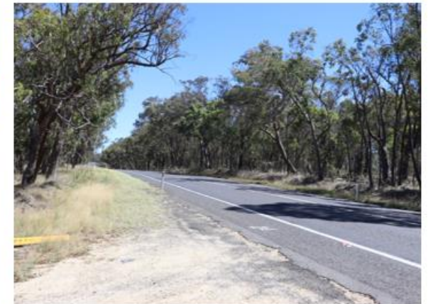
Southwest New England Highway