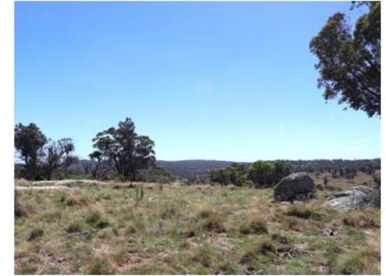
View to the North