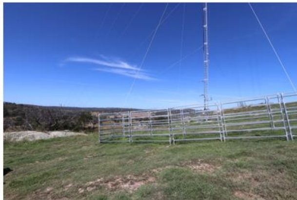
SW View – existing met. Mast KYA-03