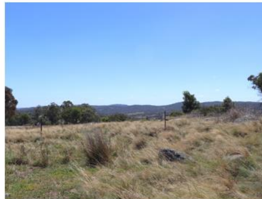
North View – with woodland in view