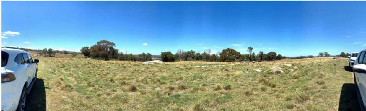
Panoramic view of West-South-East