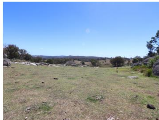
North View – to proposed turbines T30, 29, 13 and 12