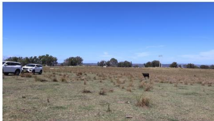
South West View with existing 330kV line