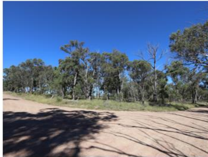
View of site from intersection of Green Valley Road and Balala (Looanga) Road