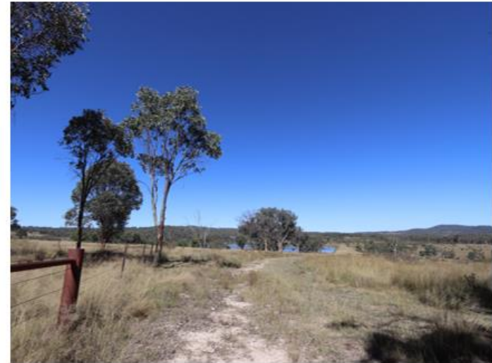
View of site and Pine Creek Dam from Green Valley Road