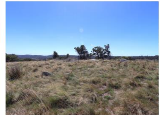
North East View