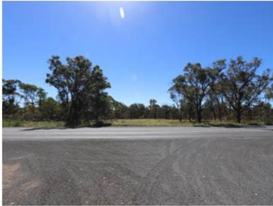
Northwest Towards Site