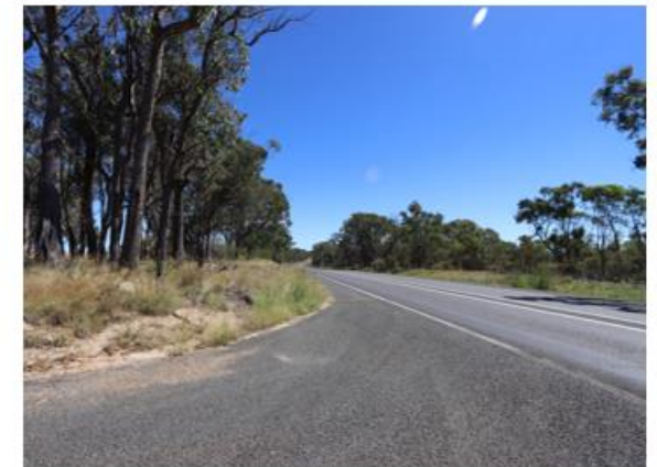
Southwest New England Highway