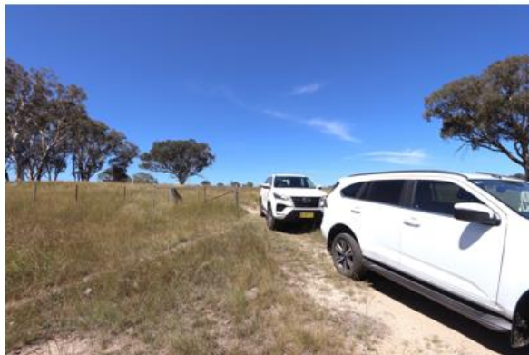
South View – toward location of proposed batching plant