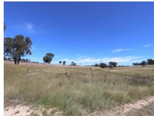
West View – direction of proposed above ground pipeline