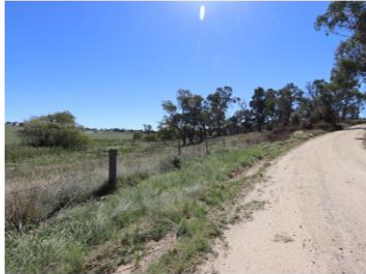
View from Rimbanda Road