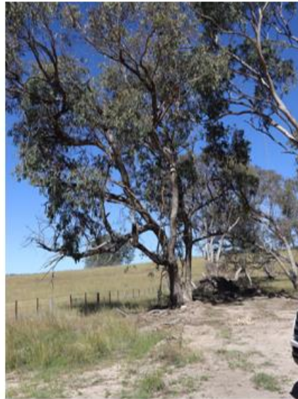
Location of T26 from Green Valley Road