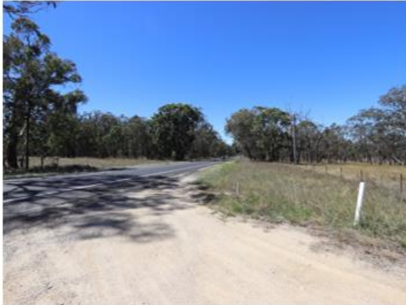
Northeast New England Highway