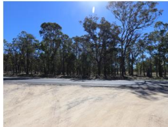
Northwest View – Towards Site