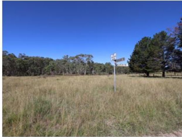
Intersection of Dalveen and Allinghams Road

Road to Receptor cluster 308, 309, 311 and 312