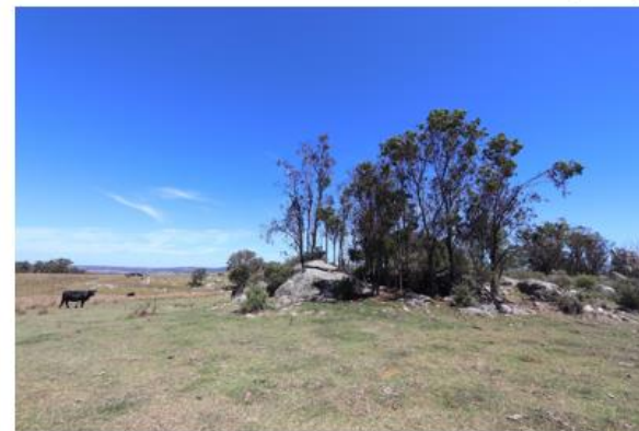
West View – to proposed turbine T31