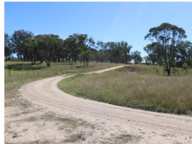
View toward Allinghams Road