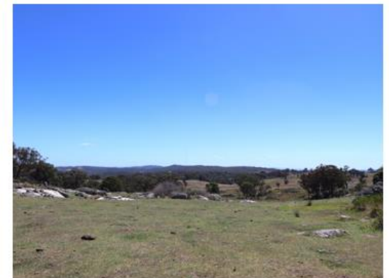
North View (Inset)