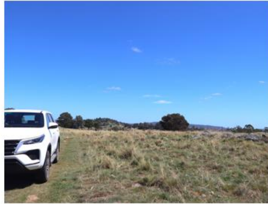
View to the West